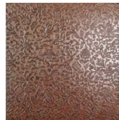
60x60 (24"x24") 60DM10