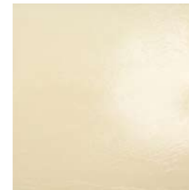
60x60 (24"x24") 6LRMH02