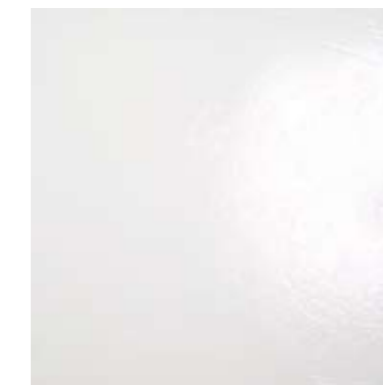
60x60 (24"x24") 6LRMH05