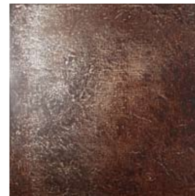
60x60 (24"x24") 6LRMH10